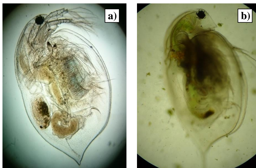
Figure 2. The morphological changes of D. magna crustacean before (a) and after (b) when exposed to sulfur mustard chemical at 0.1 ppm after 24 h (Bars, 20 \mu m, Magnification 40 \times ).

Almost general chemicals and chemicals used in the military have been shown to cause toxicity to both animals, plants and humans [1-3, 5, 8, 9]. HD is one of a group of military