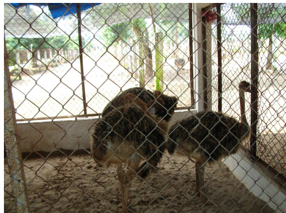
Fig. 4. Pictures of ostrich raising farm models at Ba Vi – Ha Tay, where there is not appropriate conditions for raising ostriches so it is compensable to carry sand from seashores to create artificial sand banks for the ostriches (Tran Nghi).