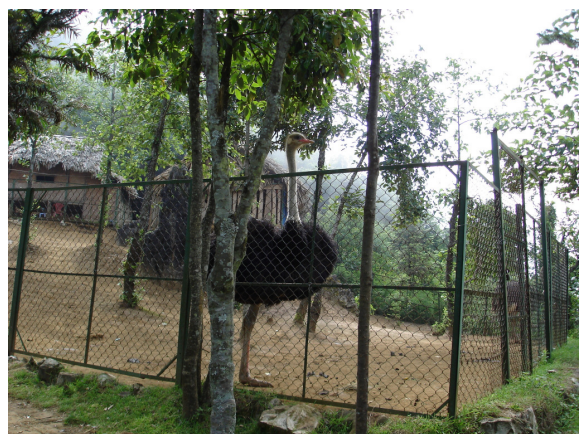
Fig 5. Ostrich raising farm on mountain Ham Rong, Sa Pa, Lao Cai.