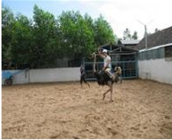
Fig. 6. Riding on an ostrich at farm Vinh Sang, Vinh Long (M.P.H).