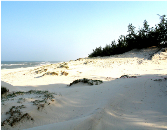
Fig. 3. Beach and sand bank south of Nhat Le estuary, Quang Binh (Ta Hoa Phuong, 2006).