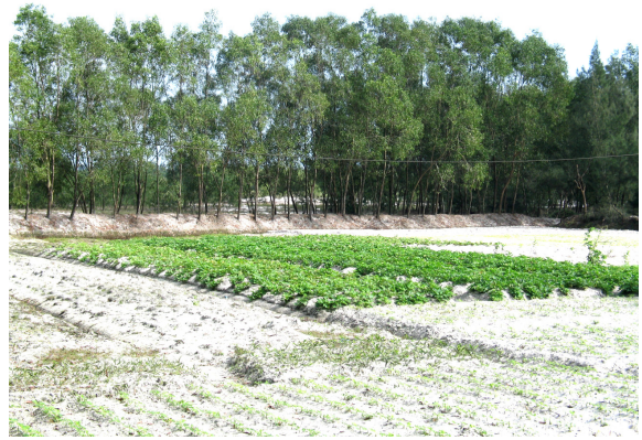
Fig. 7. eco-family unit's sand-bank economy model at Trieu Phong (Quang Tri) (Ta Hoa Phuong , Tran Nghi, 2006).

+ Each family can successfully carry out raising ostriches,