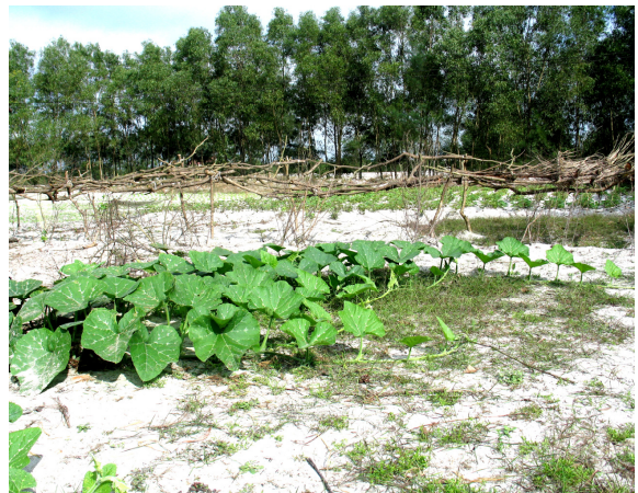
Fig. 8. eco-family unit's sand-bank economy model at Trieu Phong (Quang Tri).