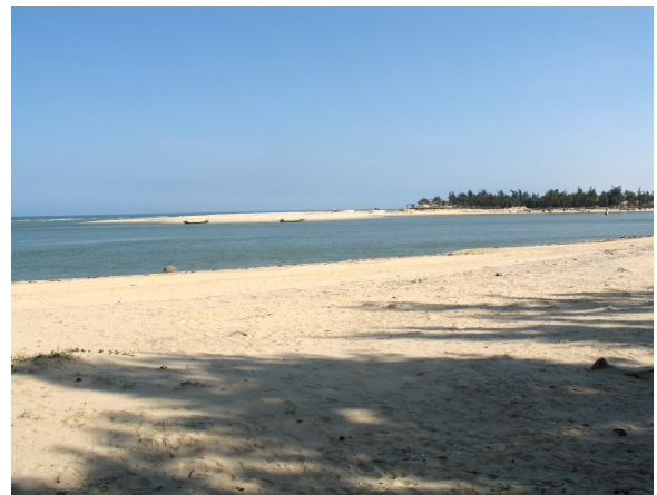
Fig. 2. Spa resort beach south of Nhat Le estuary, Quang Binh (Ta Hoa Phuong, 2006).

- Building roads along the seashore and also on white sand.