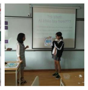
Fig 3. Student's activities in the experimental class.