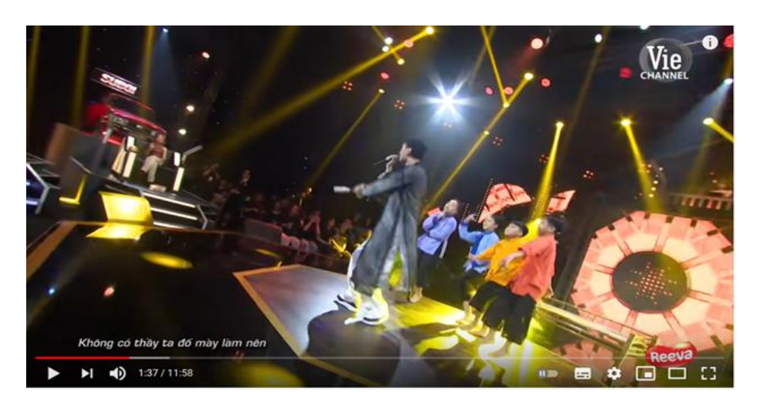
Figure 1 The Traditional Male Áo dài

added two strings to the hat to be more suitable for his stage name Dê Choắt (The Little Cricket). Nón lá is not only a common object in Vietnamese households, especially in the countryside, but also an artistic symbol in Vietnamese literature and music. Therefore, the use of this significant object has shown the young's respect for the nation's cultural values. The performance with the most prominent cultural features that can be seen from the show is PD 33. In this performance, the rapper wore the traditional male áo dài and sat on the bamboo bed while all the children who were back-up dancers were dressed in áo bà ba (Mrs. Ba shirt) and black wide pants surrounding him. This can be interpreted that the rapper was the teacher and the dancers were the students in the feudal time in a rural area. In addition, not only is bamboo a common tree for the manufacture of handicrafts or furniture in Vietnamese villages, but its durability also reflects Vietnamese resilience. This stage arrangement also indicates a deep-rooted Vietnamese tradition named tôn sư trong đạo (honoring the teachers and respecting their teaching), which shows the young's acknowledgement and commendation for the Vietnamese customs.