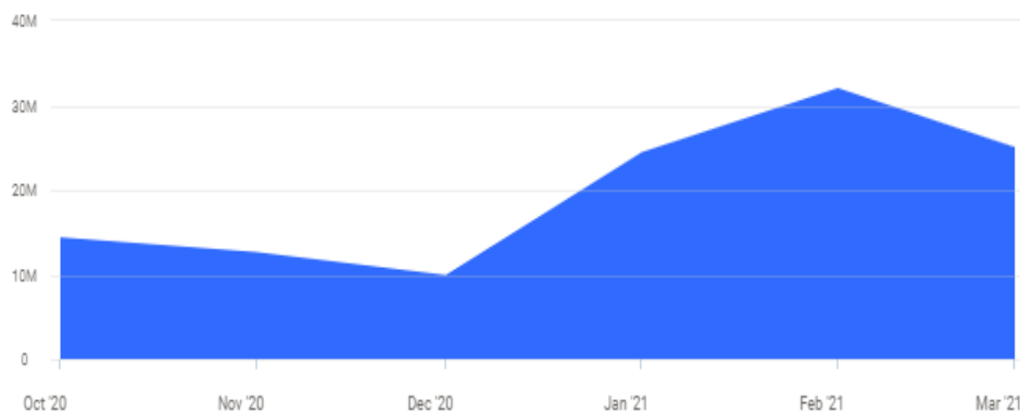
Total visits to phimmoizz.net from 20 th October, 2020 to 21 st March, 2021

Piracy conducted by USTR (United States Trade Representative), Vietnam has been put on the "Watchlist" with a great quantity of online copyright infringements in recent years. In addition, shopee.vn, phimmoi and phimmoizz are reported as selling counterfeit products and violating copyright law on digital platforms [17]. Even though the enforcement authorities have made great progress in enforcing copyright, the current situation remains challenging.