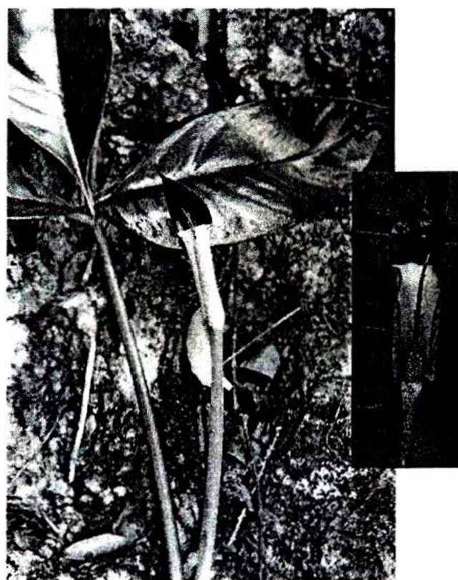
Pictures: Arisaema ramulosum Alderw Habit and femal spadix.