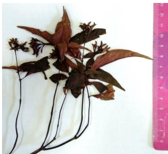
Figure 2. Morphology of Ophiorrhiza fangdingii (T.V.Do 162 at VNMN).

narrowly lanceolate, 2-2.5 mm long. Corolla white, funnel-form, 2-2.2 cm long, outside glabrous, above middle inside white villous; lobes dorsally narrowly winged, wing extending into very short horn. Stamens 5, inserted near throat to below middle of corolla tube, included; filaments reduced to well developed; anthers dorsifixed near middle or base. Ovary 2-celled, ovules numerous in each cell on placentas attaches from middle to base of septum; stigmas 2-lobed, linear to subglobose. Capsule obovoid to oblate, 2-4 mm diameter, strongly laterally compressed perpendicular to septa, loculicidally dehiscent across top and sometimes along sides, with calyx lobes persistent; seeds numerous, small, angled to rhomboid, areolate to alveolate.