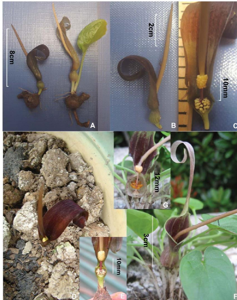
Figure 2. Typhonium cordifolium S.Y. Hu (A-E) and T. khonkaenensis Galloway & Chaenwong (F & G). A, D & F. All plant; B. Inflorescence side view; C, E & G. Organs of spadix; F. Plant and inflorescence; G. Inflorescence with spathe opened tube part.