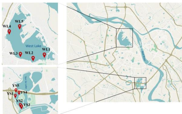
Figure 1. Sampling locations in West Lake and Yen So Lake.

This study focuses on monitoring the contamination level of PRs in two biggest lakes located in Hanoi's capital during the pandemic of COVID-19. The WL located in the North of Hanoi is the biggest natural lake in Hanoi with more than 530 ha of surface area while the YSL located in the South of Hanoi was renewed with a surface of 132 ha (a complex of 5 small lakes). These lakes receive a significant volume of municipal wastewater from hotels, restaurants, households, and even hospitals. The monitoring was performed from January 2020 to December 2020 with a frequency of every 3 months. There were a total of 20 surface water samples collected from each lake (5 fixed stations for each) according to the protocol from Vietnamese standard TCVN No.6663 - 6:2018. The sampling location was mapped as in Figure 1.